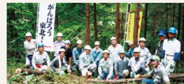
Community forest maintenance group