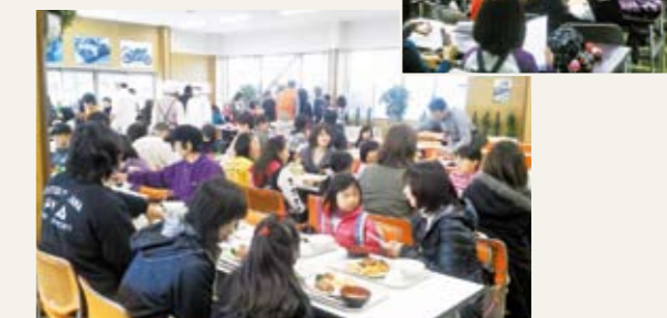
Akashi interaction group

At the museum, when the group was asked "What did you find most interesting?" a little boy eagerly exclaimed, "The bullet train!"