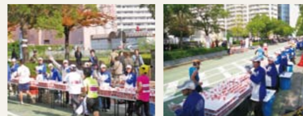
Volunteers at water station

KHI's corporate sponsorship for the inaugural Kobe Marathon 2011, held on November 20, 2011, in Kobe, was reflected on the men's number bibs. The Company was also represented by 86 volunteers who manned the water station and cheered the runners on from the sidelines.