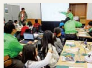
Making model helicopters

We showed the children how a helicopter and its rotor are assembled and estimated the rotor's lift force—the force that lifts the helicopter—and described some